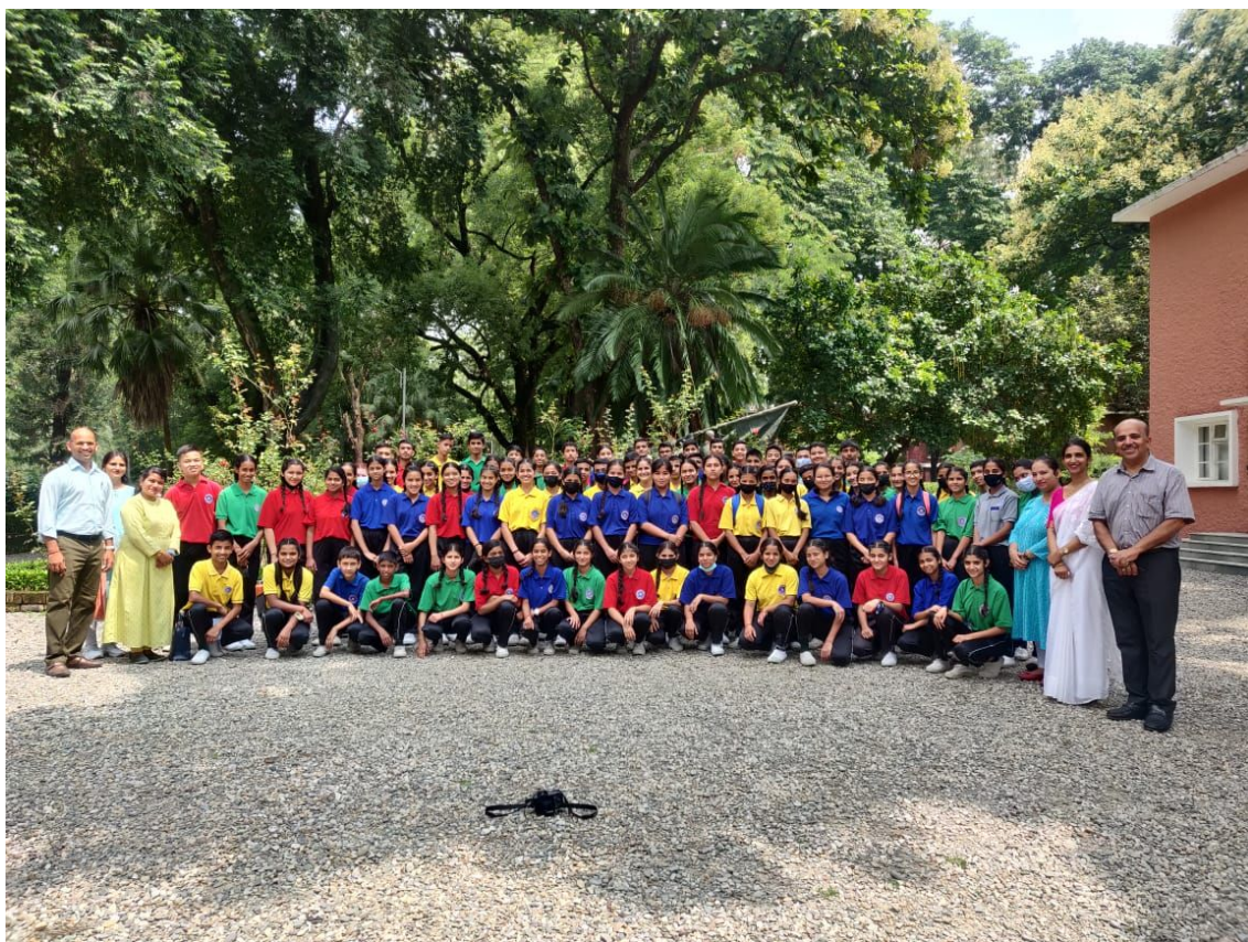
Fearless Bagh Trip