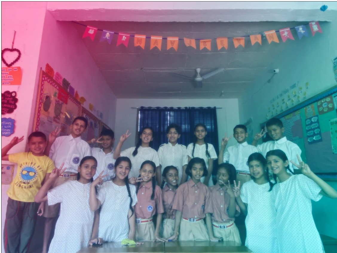
The first day in school uniform

students with skills that enable them to become self-motivated learners who are then mainstreamed into Middle School classes.