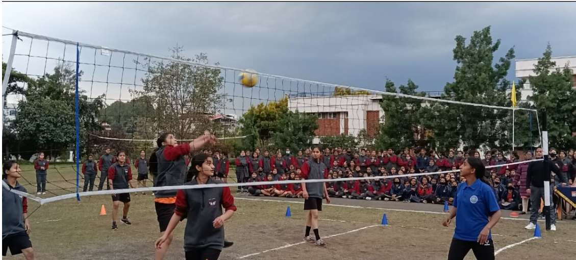
Match in Progress