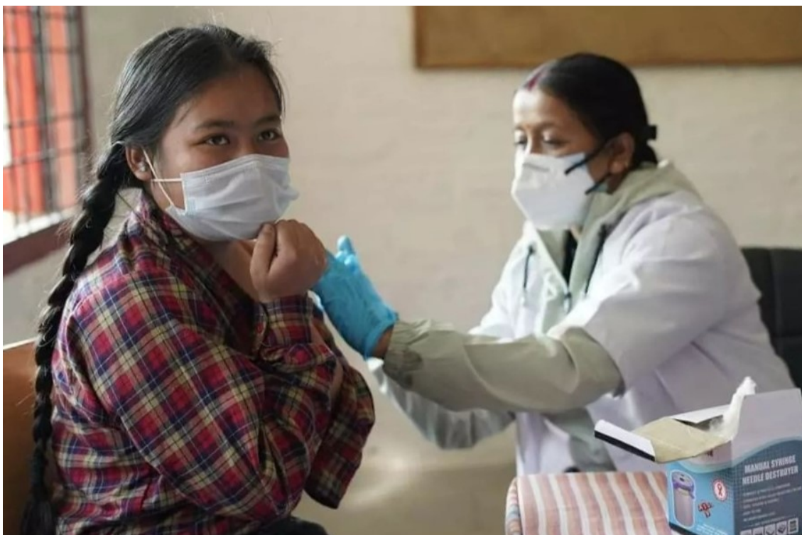
Our student getting vaccinated at our campus

When schools were closed for winter break in January, there was a surge in the Omicron variant of the COVID-19 virus in the country which once again impacted many lives. Meanwhile, with the assistance of the state government, our campus became one of the vaccination centers for the city. We allocated separate areas for waiting,