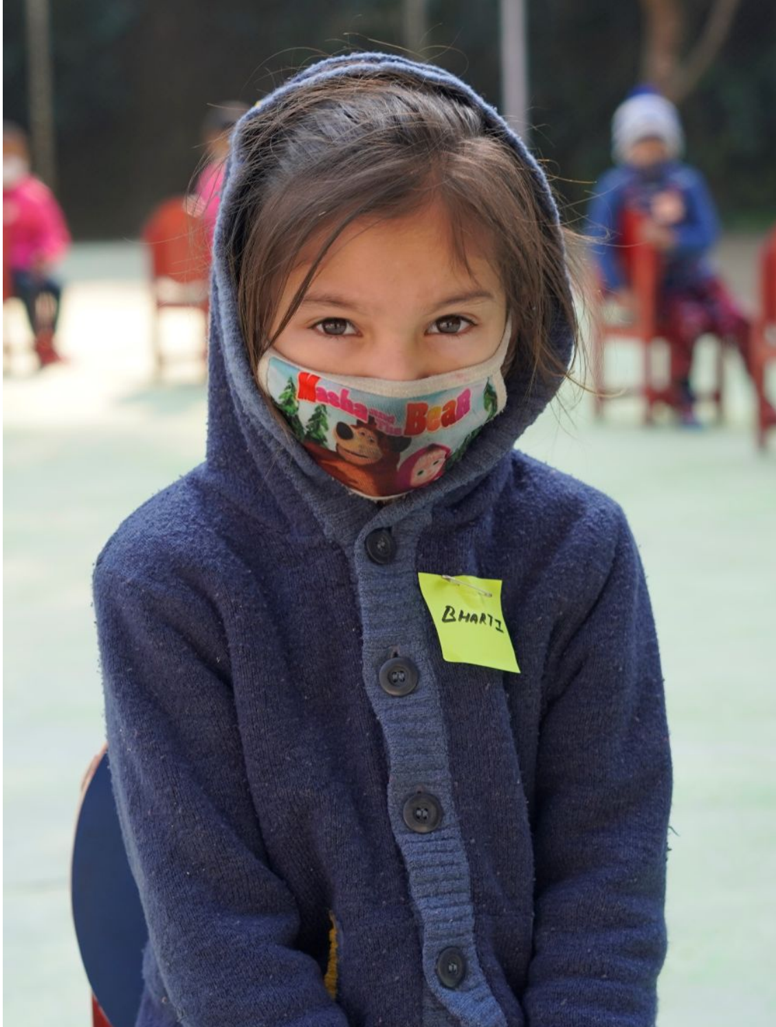
A child appearing for the assessment

A total of 99 students wrote the admission test for the 25 seats in Class I, and 97 students for the 11 seats in Class VI. Of these, 45 students were shortlisted on the basis of their test performance and learning potential for further, in-depth assessment. As a first step, their homes and neighborhoods were visited by our staff to get a first-hand picture of their socio-economic conditions. Basis this, a shorter list was compiled of students whose families met the need-based admission criteria. These families and their children were then invited to the school for an in-person assessment. Based on this, the list was pruned further and a second visit was made to their homes to ensure nothing had been overlooked.