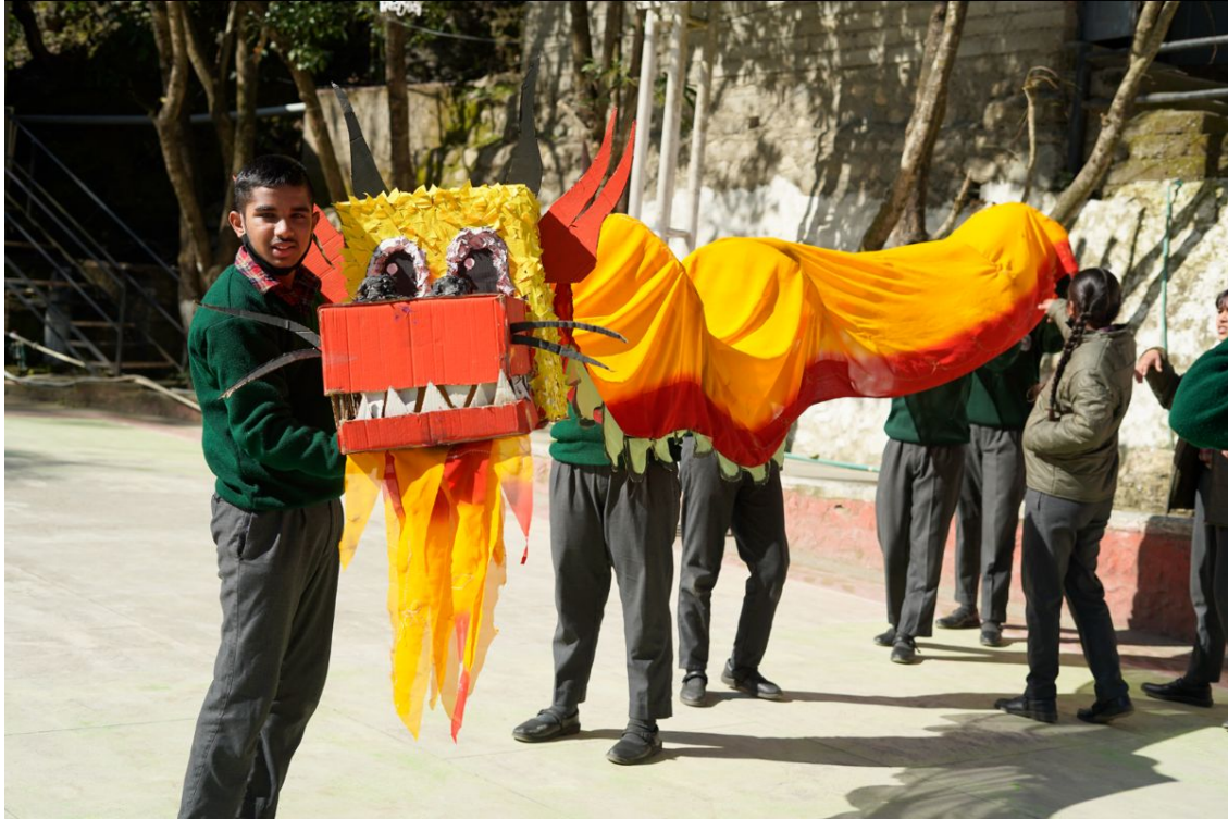
Children enacting 'The Tale of Custard the Dragon' as a cross-curricular exercise

The buzz is at its peak with all our children back on campus. We enjoy having our meals together and the look of delight on our little one's faces is priceless. Our halls are once again gilded with the reflections of our children's smiles. Students of Class I and II who are new to the campus were nervous at first, but the joy of sharing spaces with their classmates gradually forged new friendships and the spirit of PYDS ignited again!