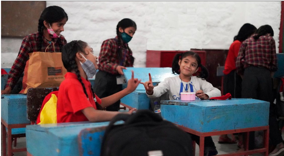
Children greeting each other after full school reopening

We enter the next Academic Year with an unshakeable resolve of continuing our journey with the same vigor and look forward to resuming our full-day program after an unanticipated two years of online learning. Despite the dedicated efforts of our teachers and students to effectively implement online learning during the pandemic and a collective attendance of 99%, many activities that children need for their holistic development, such as peer-to-peer learning, eating together and co-scholastic activities remained virtually suspended. As we gladly resume our full school schedule, we look forward to expanding our horizons and reintegrating various activities into the curriculum of all our children.