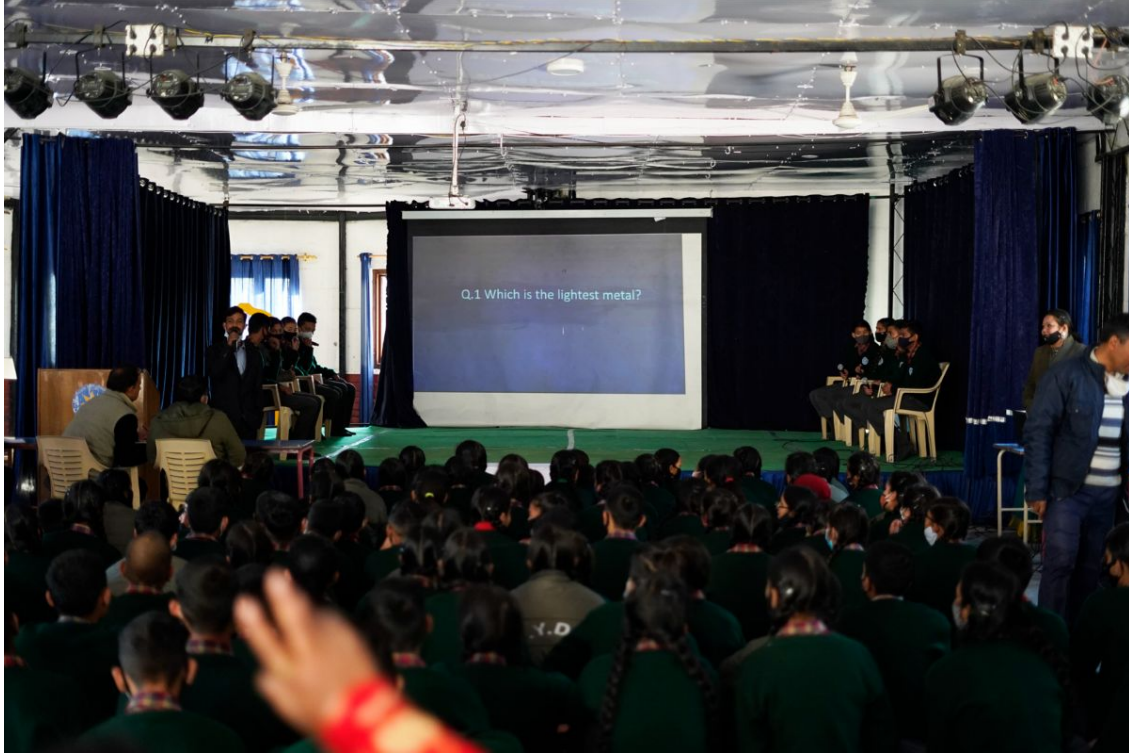
Students participating in the science quiz

All participants displayed a deep understanding of the topics that were covered. The audience also greatly enjoyed the quiz as it helped them learn various interesting facts.