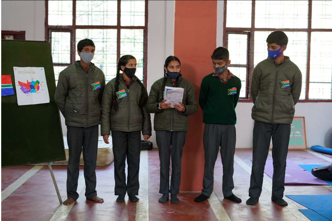
Children representing South Africa in an MUN session

As part of our experiential learning exercise, an engaged learning process where students learn by doing and develop a deeper understanding of concepts through experience, our Class VII students organized a session of Model United Nations to learn about diplomacy, international relations, and the United Nations.