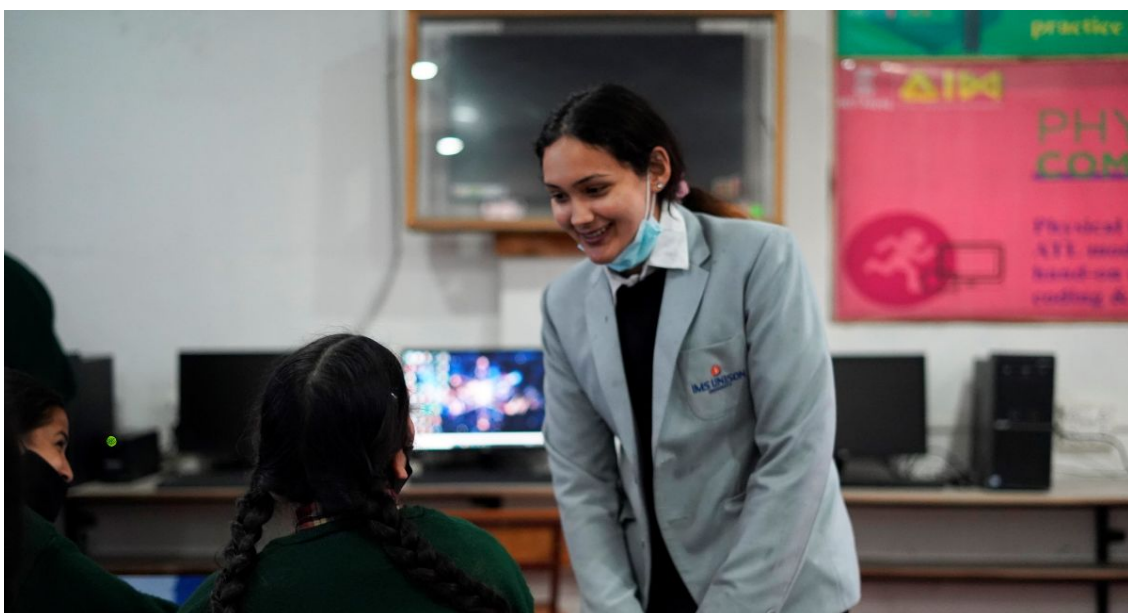
An IMS student interacting with our student

We played host to Liberal Art students of IMS Unison University, who visited our campus on February 26 to commemorate the upcoming World NGO Day. They were delighted to interact with our students and enjoyed exploring the activities on our campus. Their visit concluded with a message on drug abuse where, through a short skit, they advised students and staff to steer clear of drugs.