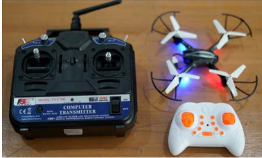
Electromagnetic Wave Transmitter and Quadcopter

the latest equipment. Many of our tools and devices required replacement as they were either outdated or defective and presented a major hurdle in our children's intuitive learning. We were also able to procure a few extra tools which go beyond the prescribed curriculum and have proved essential for hands-on learning and encouraging students to pursue these subjects as areas of interest. These tools can be used to demonstrate several experiments and principles of science.