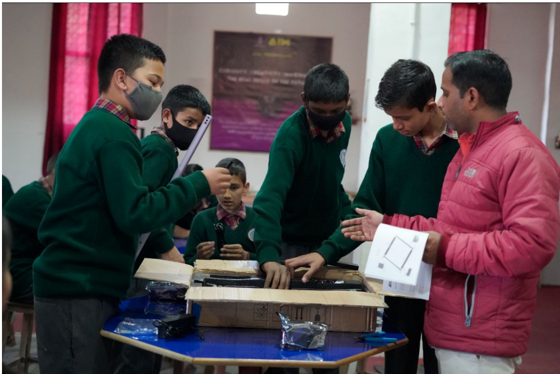
Children assembling 3D Scanner

We have strengthened and enhanced our STEM initiative and we have been able to equip our Science and Tinkering laboratories with some of